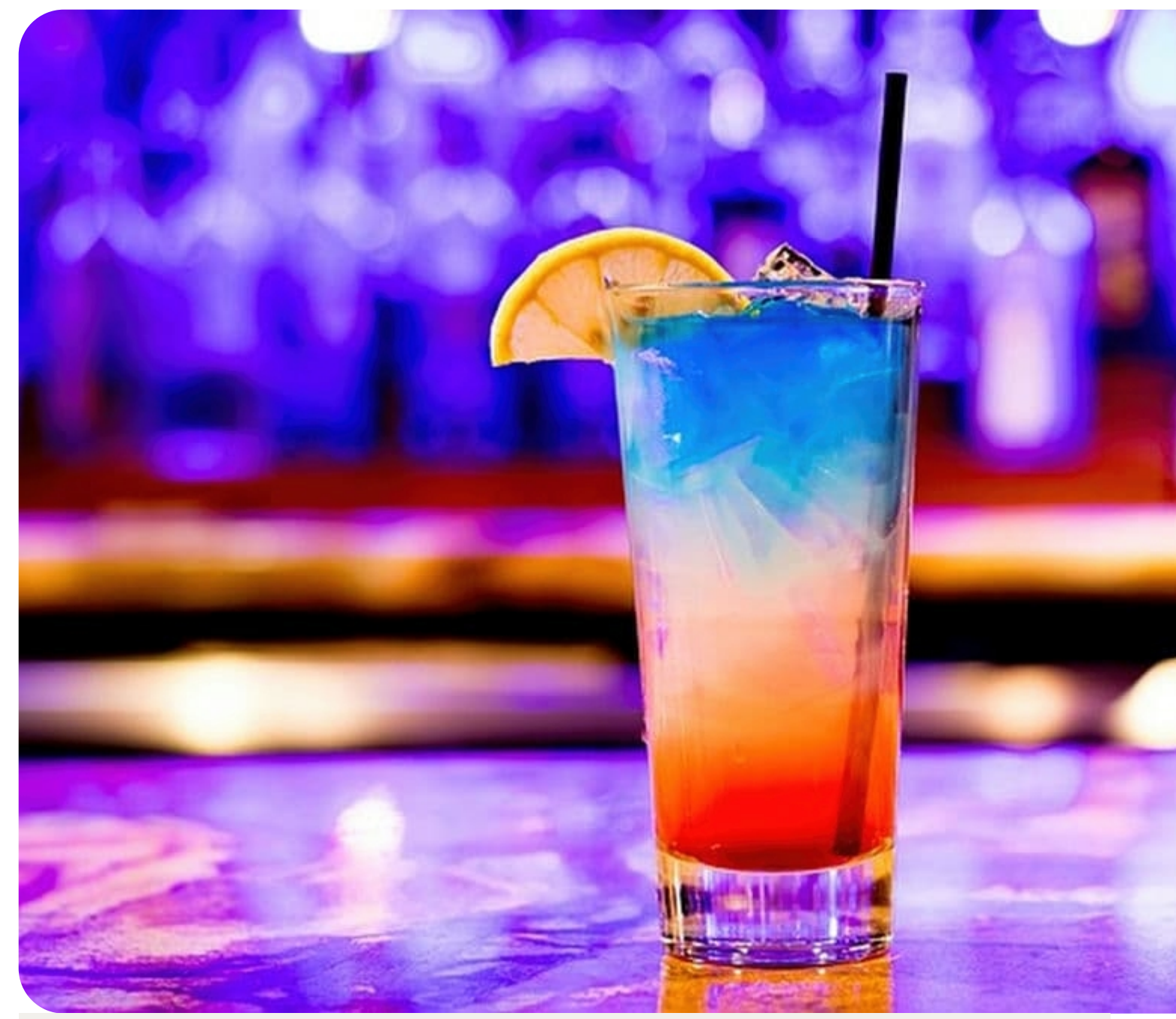
Understanding the Differences: Part-Time vs. Full-Time Bartending