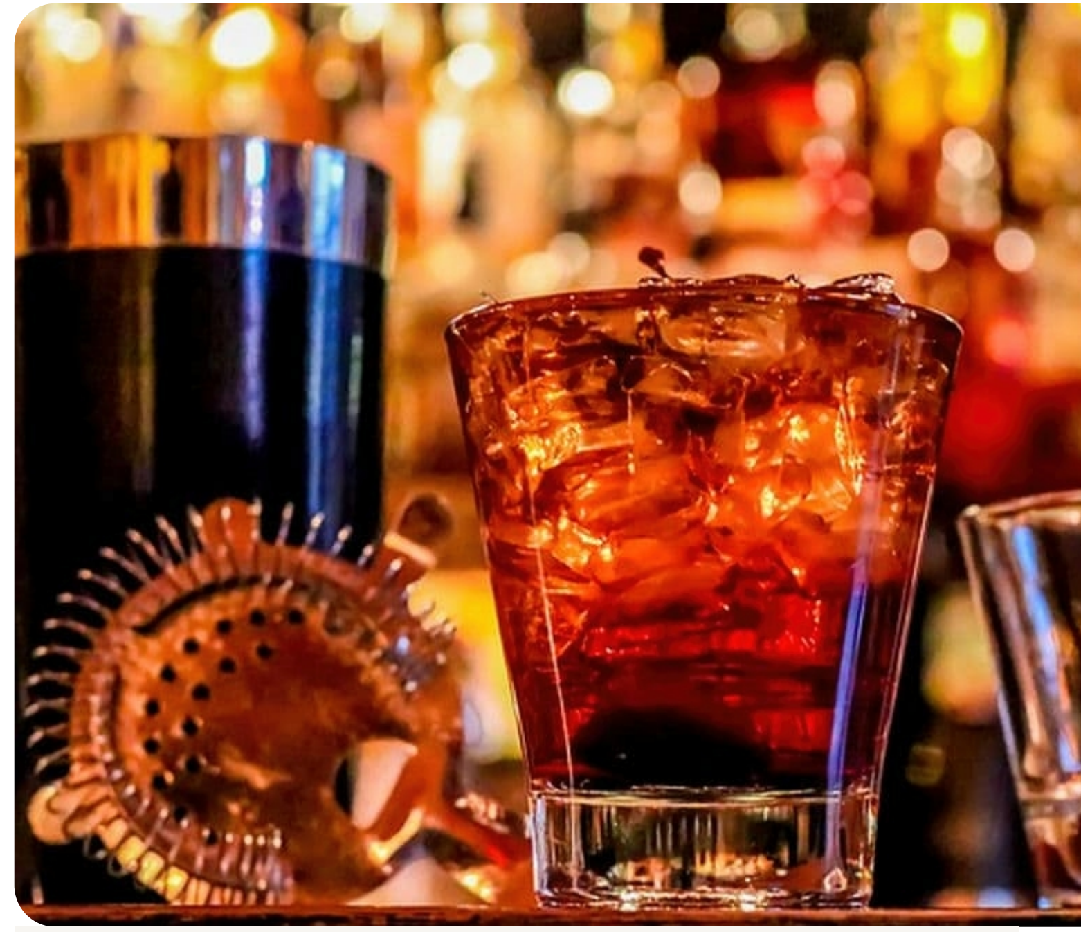
Consider Your Options Part-Time or Full Time Bartending